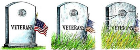
DAVE GRANLUND ©

Sponsorship applications may also be requested through the Veterans Memorial Park Office at 845 808 1994 or visit the office at 201 Gipsy Trail Road, Carmel NY