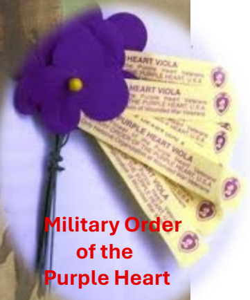
Military Order of the Purple Heart