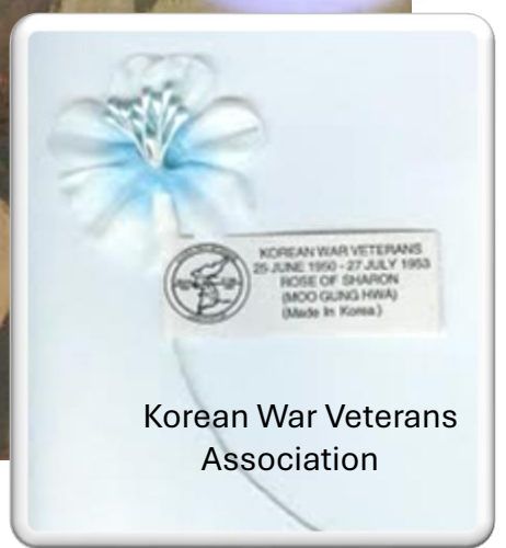
Korean War Veterans Association