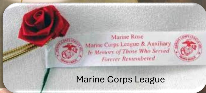
Marine Corps League